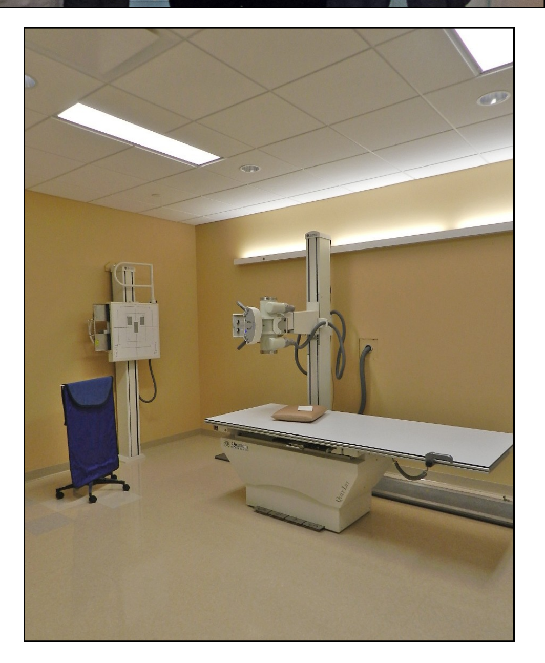
REILLY ELECTRICAL CONTRACTORS, INC.